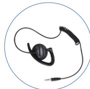
Receive-only Swivel Earset EH-02