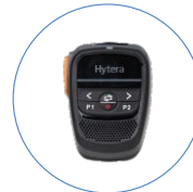
Wireless Remote Speaker Microphone SM27W2