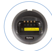
Charger (2A) CH20L13