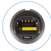
Charger (1A) CH10L29