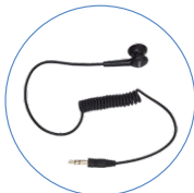
Receive-only Earbud ES-01