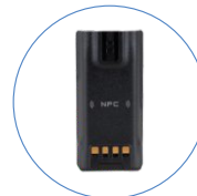
4,000 mAh Li-poly Battery BP4005