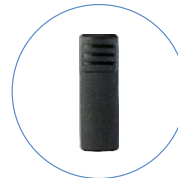
Belt Clip BC39