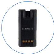
2,400 mAh Li-Poly Battery BP2402