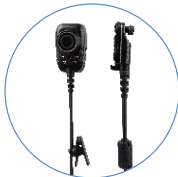
USB Camera VM220-N1