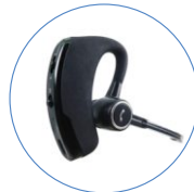
BT Earpiece EHW08