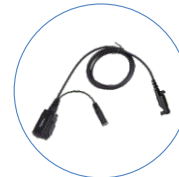
PTT&MIC Controller ACN-02