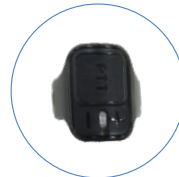
Wireless PTT POA121