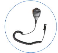
Water-proof Remote Speaker Microphone SM26N1