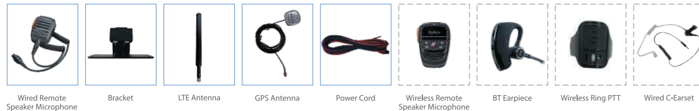
Wired Remote Speaker Microphone